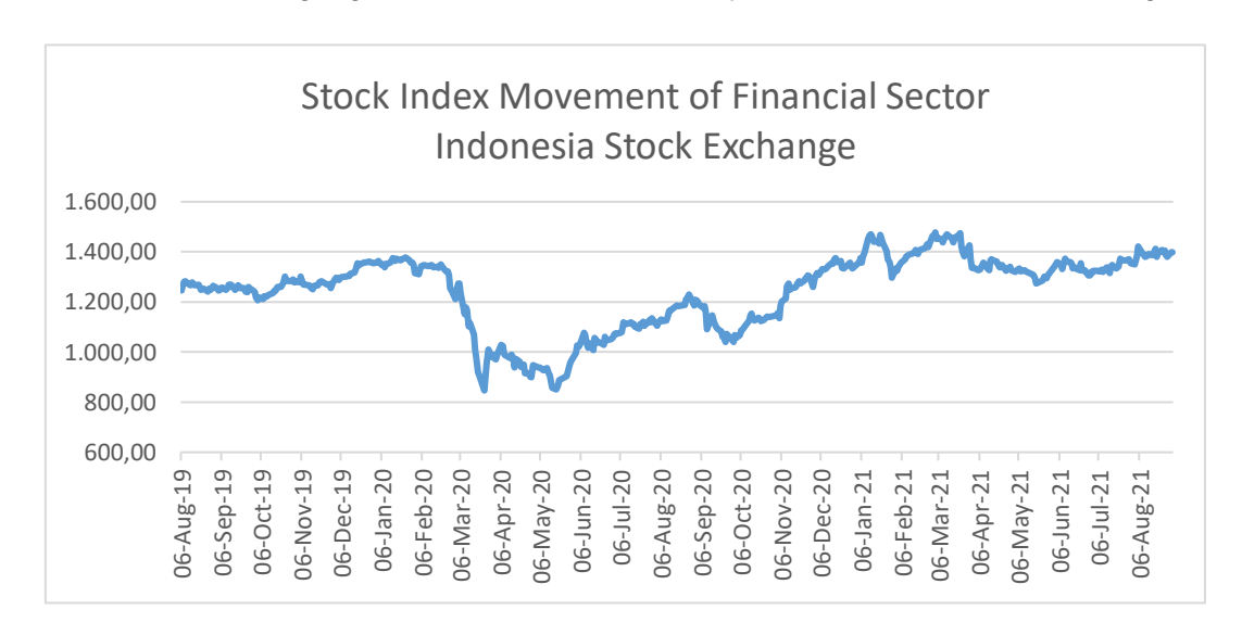
Figure 1. Stock Index Movement of Financial Sector Indonesia Stock Exchange

debtors in their business or incomes (Elena, 2020). This triggered negative sentiment among investors and affected the movement of the financial sector stock index on the Indonesia Stock Exchange. At the beginning of the emergence of the Covid-19 case in Indonesia, the financial sector index experienced the deepest correction in the last five years, reaching the level of 846.62. This value continued to hold, and began to increase in June 2020, although since then this index has been showing an increasing trend, until now, it is still showing high fluctuations and has not yet reached its momentum of growth.