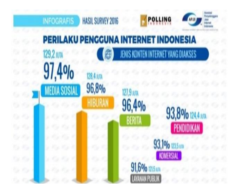
Figure 1. The Data of Internet User based on the Accessed Content

from Facebook, Twitter, Instagram, and other social media. The purpose of using the internet in Indonesia varies from chatting, sending pictures, giving comments on a particular product, to marketing a business for free.